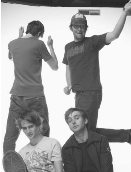
Dappled Cities Fly