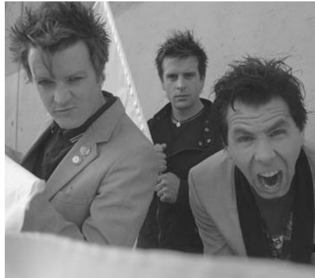
The Living End